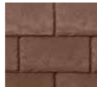
CR-738 Red Cedar