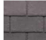
CR-734 Mountain Plum