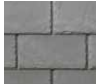
CR-731 Ash Grey