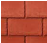
CR-735 Terra Cotta