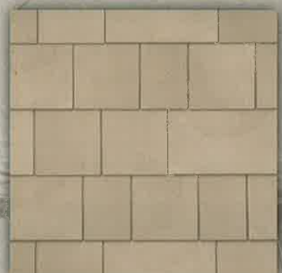
Your Custom Blend